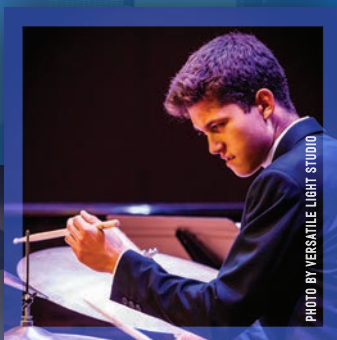
STAMPS FAMILY CHARITABLE FOUNDATION MUSIC SCHOLARSHIPS

Our diverse campus will enhance your learning and deepen your appreciation for other cultures and musical influences. All in a city like you—young, vibrant, and ever evolving.