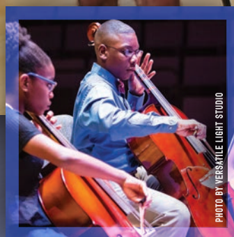
PLAYING IT FORWARD

A unique offering for 19 high achieving, academically and musically talented students! Each Stamps Scholar is offered full tuition, room and board for four years of undergraduate studies, as well as stipends for performance travel and other artistic experiences. Invited students perform in Stamps ensembles and participate in Stamps Family Charitable Foundation leadership events. You must be accepted by the University of Miami, pass Frost School of Music auditions, and be officially accepted to the Frost School to qualify for invitation.