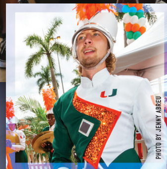
FROST BAND OF THE HOUR

Want to make a difference in the world? Play it forward as a mentor, teacher, and role model in the Frost School of Music's Donna E. Shalala MusicReach Program. Selected undergraduate students may receive a $5,000 mentor scholarship to participate in the MusicReach mentorship program, which involves teaching music to children and teens from underserved communities in South Florida, either on campus or in an after-school setting. Set yourself on a path to becoming a successful and socially responsible member of the professional music community!