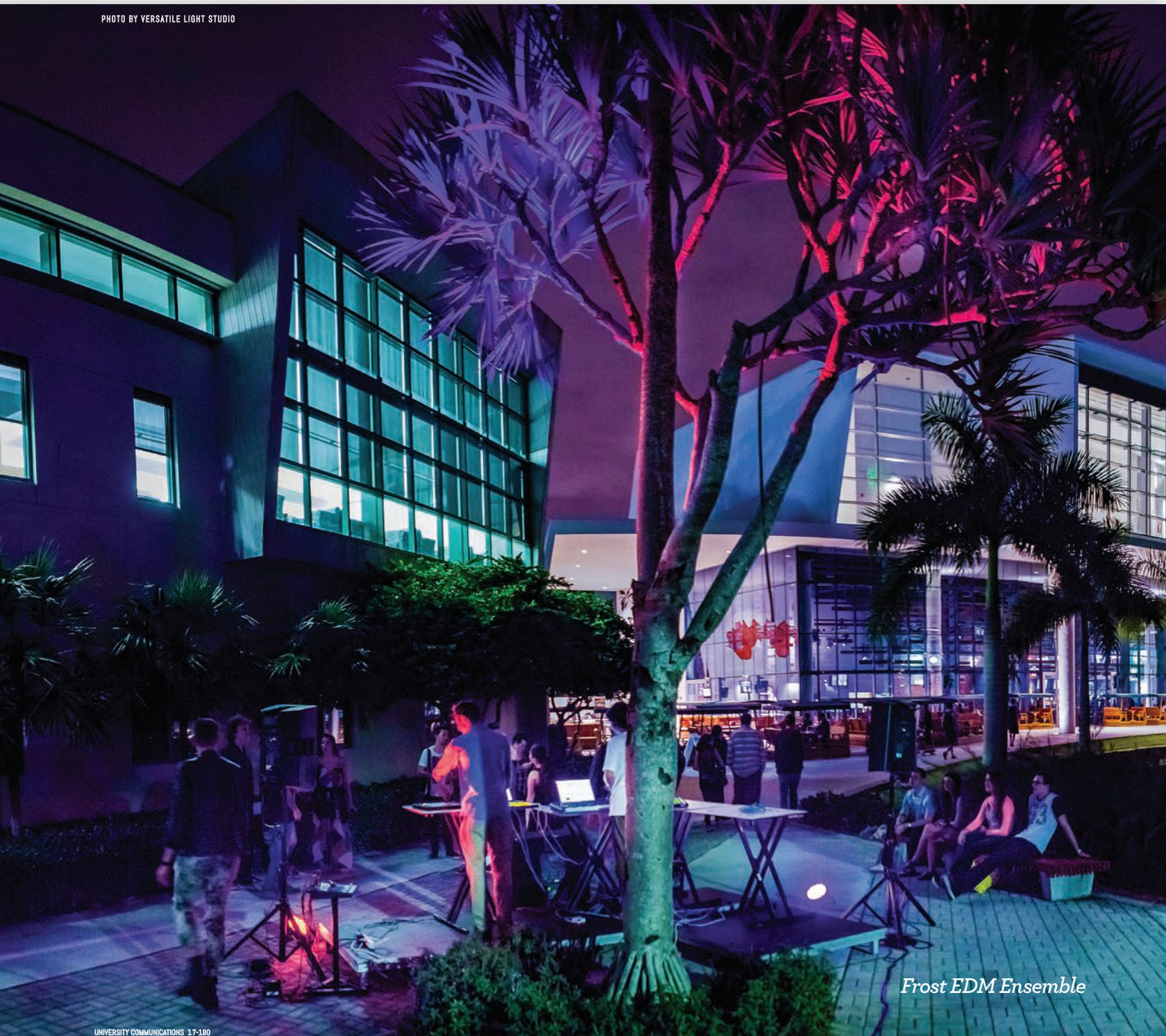
Frost EDM Ensemble