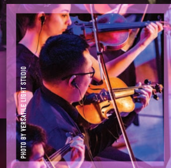
HENRY MANCINI INSTITUTE